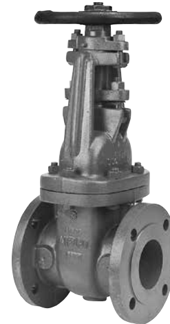
F-637-31 Flanged-Raised Face