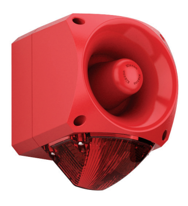
Applications - Conveyors; process control alarm; cranes; moving machinery; general signalling; marine