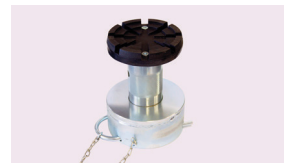
Height adapter 155-245 mm