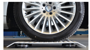
Drive-on plates (4 units)