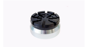
Height adapter 44 mm