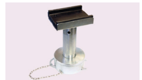
U-form adapter 150-233 mm