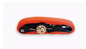
Lashing straps (2 units)